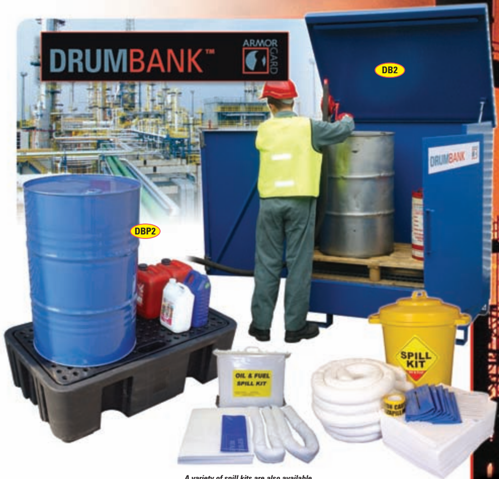
A variety of spill kits are also available.

DrumBank is designed for the safe storage and dispensing of fuel in 205 litre drums. The enclosed store is designed specifically to protect the fuel from theft.